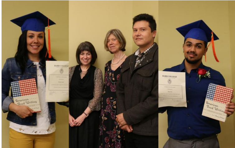
FACES OF WORCESTER CLEMENTE